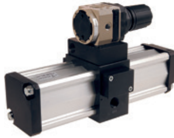
63mm complete with Regulator, BSPP