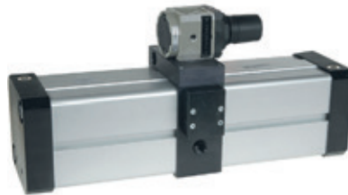
100mm complete with Regulator, BSPP