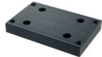
Mounting Bracket 40/63/100mm