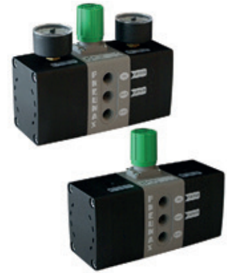
P+ Pressure Booster 40mm 0-20 bar complete with Gauges