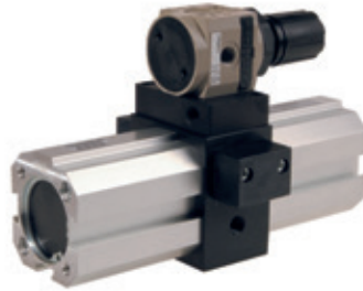
40mm complete with Regulator, BSPP