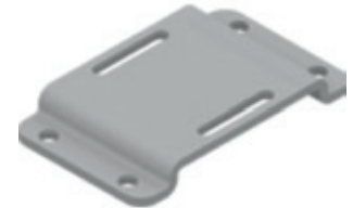
P+ Pressure Booster Mounting Bracket