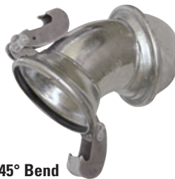
Male x Female 45° Bend