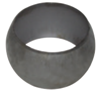
Male Weld Ends