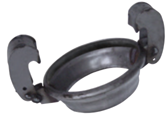
Female Weld Ends