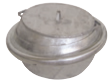
Male Blank Ends