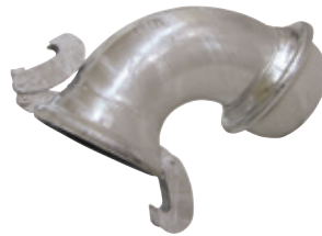
Male x Female 90° Bend