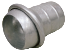
Male Hose Tail