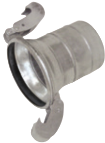
Female Hose Tail