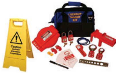
Lockout Kit, Medium