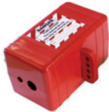
Electrical/Pneumatic Plug Lockout