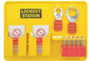
Lockout Board, 5 Station