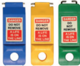
Mini Circuit Breaker Lockout