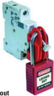
Universal Circuit Breaker Lockout