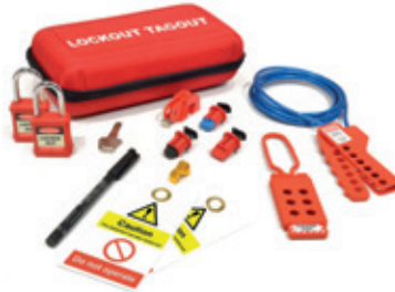
Maintenance Electrical Lockout Kit