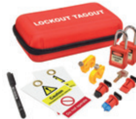
Electrical Lockout Kit